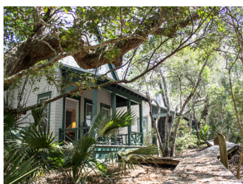
610 Chicamacomico Way $489,000 3 Bed/3.5 Bath - Forest Cape Fear Station

On Saturday, join us after Open Houses at Old Baldy for the 200th Birthday Celebration!