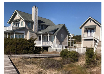
813 S. Bald Head Wynd $1,245,000 4 Bed/4.5 Bath - Oceanfront Killegray Ridge