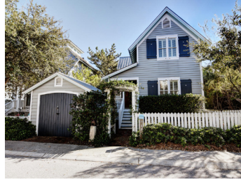
11 Windward Court $1,195,000 3 Bed/3 Bath - Marshfront Harbour Village

Looking for family fun? Stop by an Open House or 6D Merchants Row for an Island Scavenger Hunt!