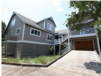
25 Horsemint Trail $895,000 3 Bed/3.5 Bath - Golf Course Off W. Bald Head Wynd