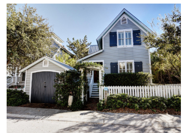
11 Windward Court $1,195,000 3 Bed/3 Bath - Marshfront Harbour Village