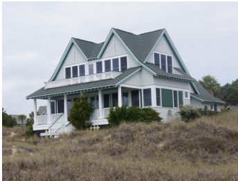
6 Kinross Court $1,149,000 3 Bed/4.5 Bath - High Dunes Off S. Bald Head Wynd