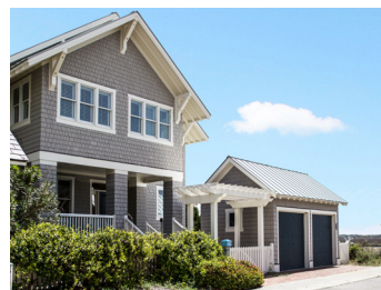
8 Leeward Court $1,695,000 3 Bed/4.5 Bath - Marshfront Harbour Village