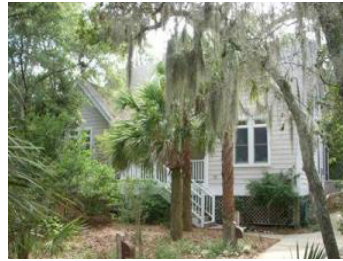
112 Stede Bonnet $629,000 3 Bed/3.5 Bath - Golf Course On the 3rd Fairway