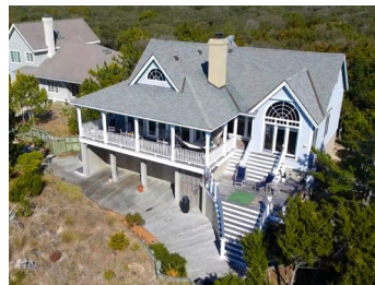
9 Bayberry Court $1,949,000 4 Bed/3.5 Bath - High Dunes Off S. Bald Head Wynd