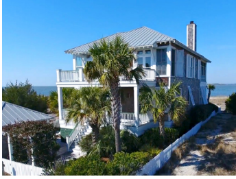
102 Turks Head Court $2,700,000 4 Bed/4 Bath - Riverfront Harbour Village