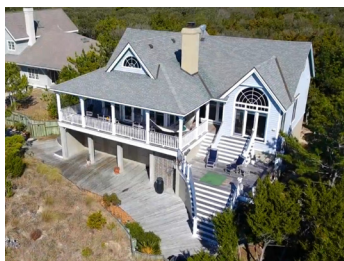
9 Bayberry Court $1,949,000 4 Bed/3.5 Bath - High Dunes Off S. Bald Head Wynd