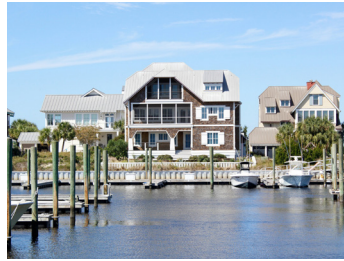
207 Row Boat Row $1,985,000 4 Bed/4.5 Bath - Marina Harbour Village