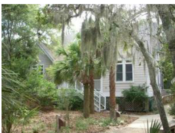
112 Stede Bonnet $629,000 3 Bed/3.5 Bath - Golf Course On the 3rd Fairway