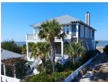
102 Turks Head Court $2,700,000 4 Bed/4 Bath - Riverfront Harbour Village